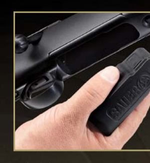
FAST Detachable 5-round flush fit