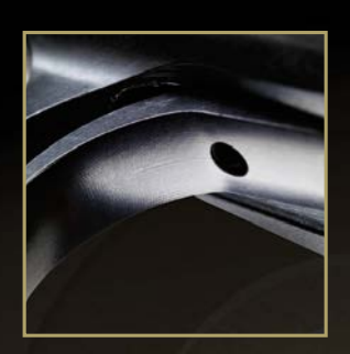
VERSATILE Adjustable trigger from 2.2 to 4.2 pounds