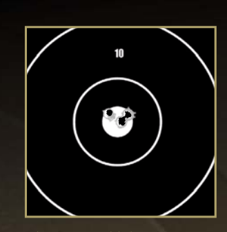
ACCURATE Sub-minute accuracy